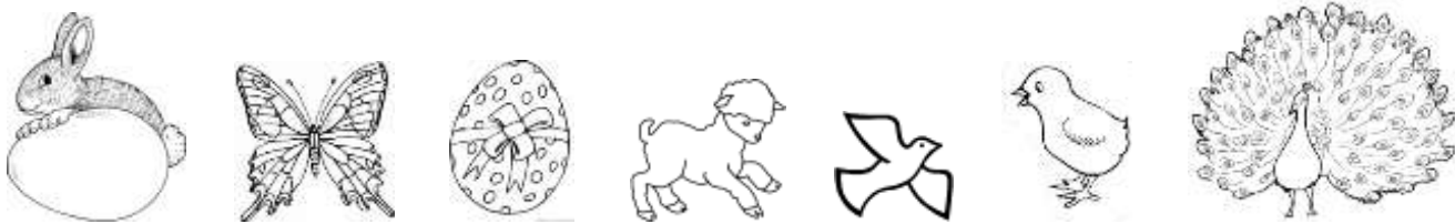
Sunday Monday Tuesday Wednesday Ascension day Friday Saturday