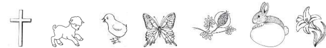
Sunday Monday Tuesday Wednesday Thursday Friday Saturday