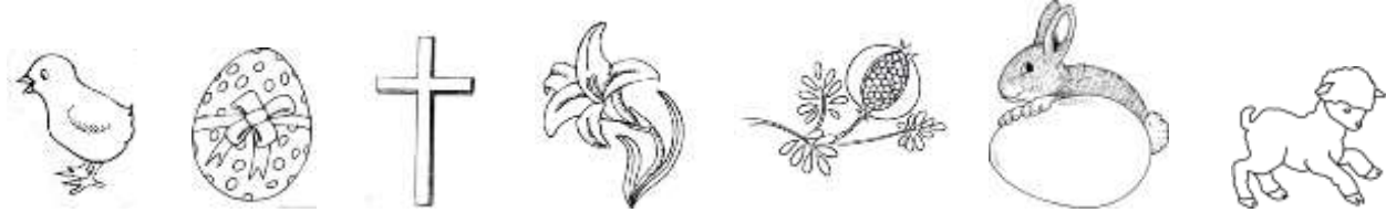
Sunday Monday Tuesday Wednesday Thursday Friday Saturday