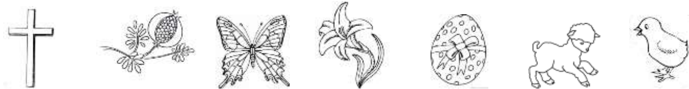
Easter Day Monday Tuesday Wednesday Thursday Friday Saturday